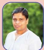
Revered Acharya Balkrishna Ji